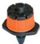
Shrubbler® 360° PC Barb 0.16"

Pots, planter boxes, balcony, patio and landscape applications.