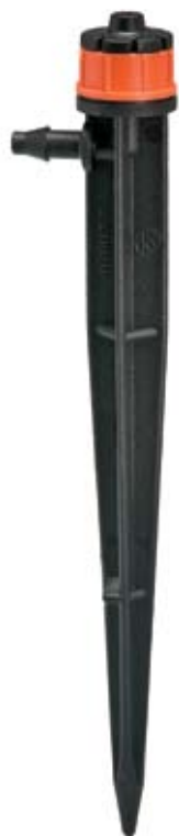
Shrubbler® 360° PC Spike 0.16"