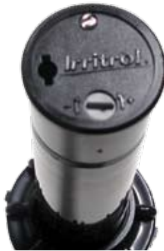
Familiar top arc adjustment